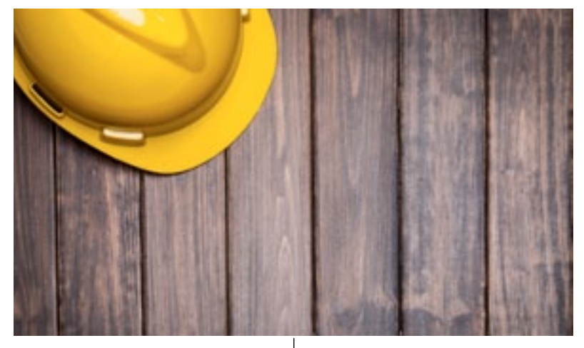
Be secured by ...

a safe design for all systems a safe product handling keyword protected areas customer quality systems support system risk assessments a general CE compliance regulatory and legal compliance